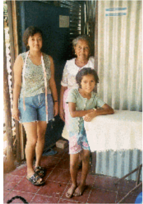
Three generations affected by the devastating earthquakes.