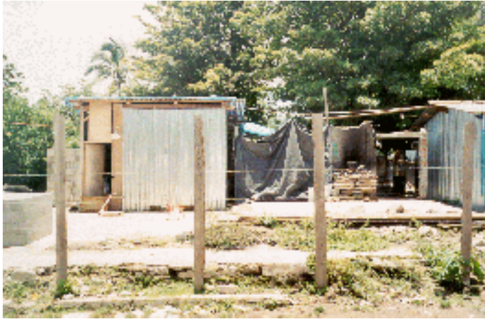
Due to the aluminum walls, this type of temporary housing is referred to as a "microwave."