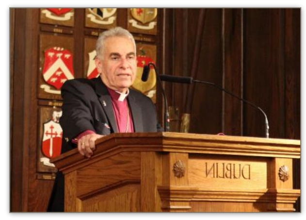
Speaking at a reception in the Mansion House in Dublin, hosted by the Amb. of the State of Palestine

violence and destruction so I hope we can work together for peace and reconciliation," he stated.