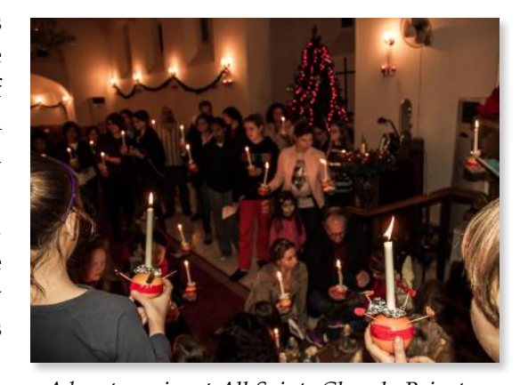
Advent service at All Saints Church, Beirut

Imad: The main challenge for our church in Beirut, mainly among the Arabic speaking congregation, is the increasing age of parishioners. Our church is mainly composed of approximately 95% of Palestinian families who migrated to Lebanon in 1948. Many of the younger family members tend to move to other parts of the world after marriage, thus creating a