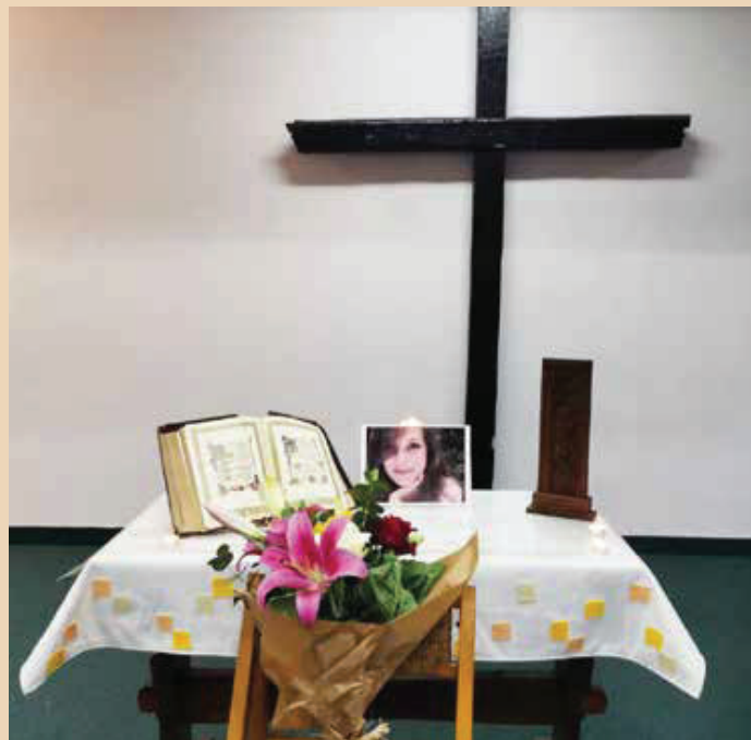
Memorial Service at N.E.S.T.