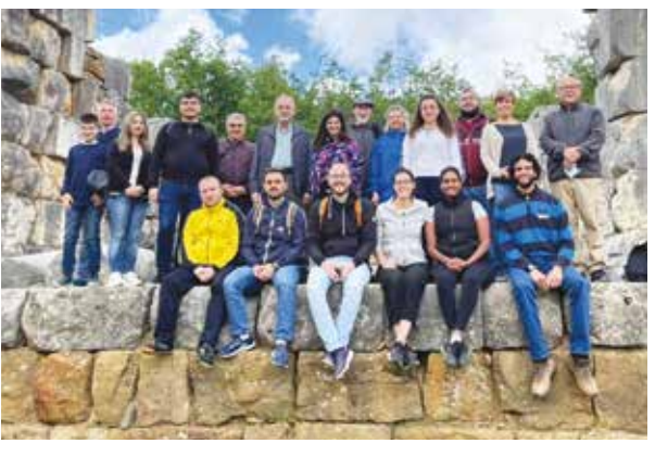
NEST Group in Yanouh

As has become customary every Spring, NEST held a one-day trip/Retreat on May 7. The trip took students and faculty members to the oldest Maronite Church in Lebanon in Yanouh, in the district of Byblos, which also has the oldest patriarchal seat of the Maronite Church. At that site, the NEST group reflected on God's Word, prayed and sang hymns. Later on the group visited a local winery and the Afqa grotto, after having had lunch in Qartaba.