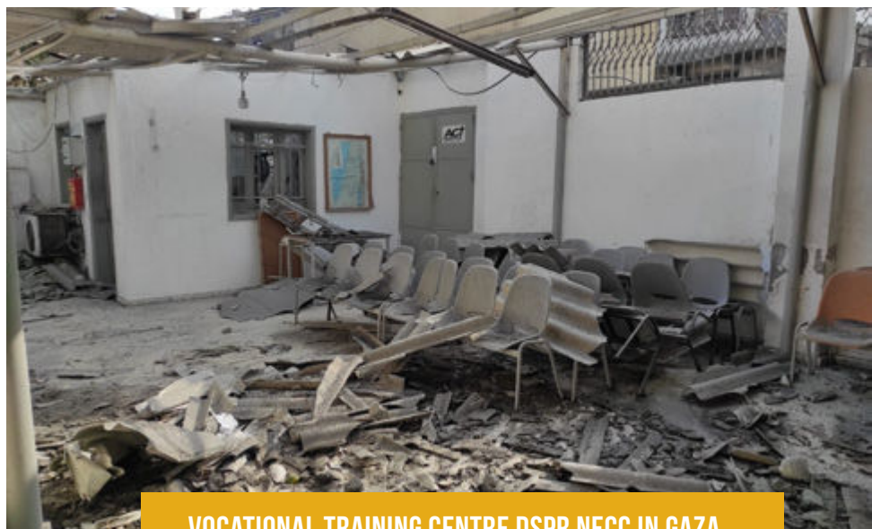
VOCATIONAL TRAINING CENTRE DSPR NECC IN GAZA