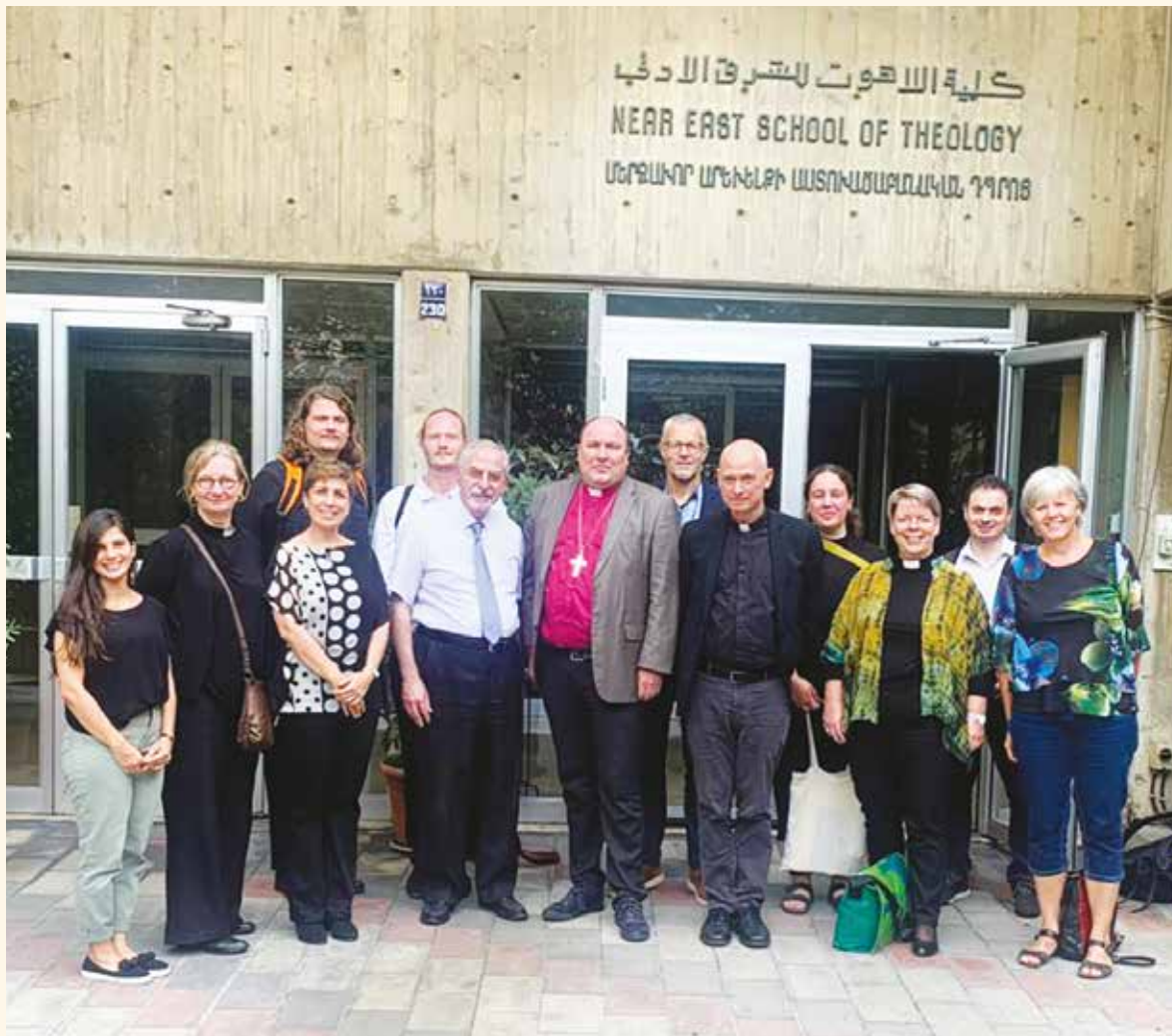
The Danish delegation