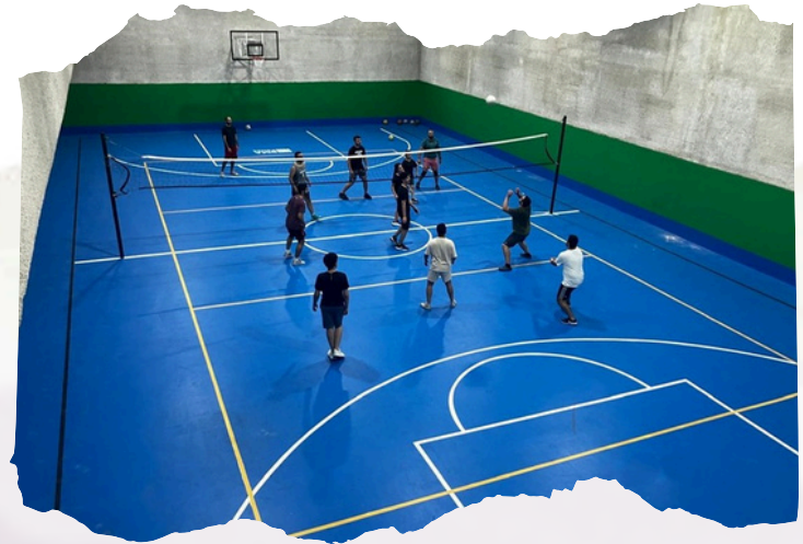
The Newly Refurbished Sports Facility

This academic year, one of our priorities is to transition, at least partially, to solar energy to meet our electricity needs and reduce hefty fuel expenses (and toxic pollutants!) from our electricity generators.