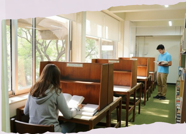
The Brightened Up Reading Room

Considerable waterproofing work was completed on the basement floors to preserve the structural integrity of the building. Our students were welcomed back to campus with a newly refurbished sports facility, and our library was upgraded and brightened up with new lighting and welcoming reading space.