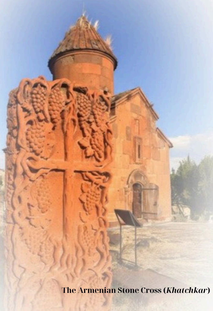
The Armenian Stone Cross ( Khatchkar )

The photo below is of an Armenian stone cross, a Khatchkar , which I took during our trip to Armenia last month. The abundant vine around the cross reflects so nicely the idea of fruitfulness by being rooted in Christ.