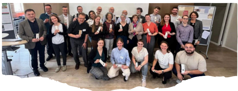
Celebrating 25 years of SiMO