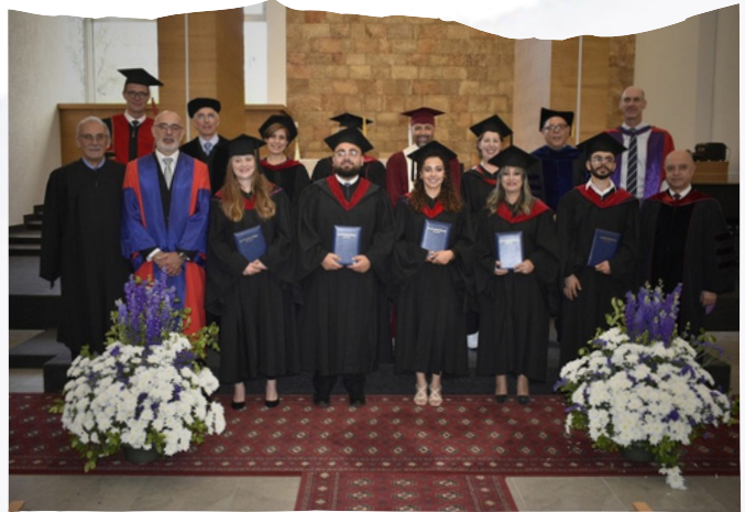
NEST 2025 Commencement Ceremony

We were proud to graduate 5 students locally from our core accredited programs and 35 in Armenia from the Certificate in Biblical Studies and Christian Education. Our newest alumni join the exceptional cohort of leaders called to serve their church communities throughout the region and the world.