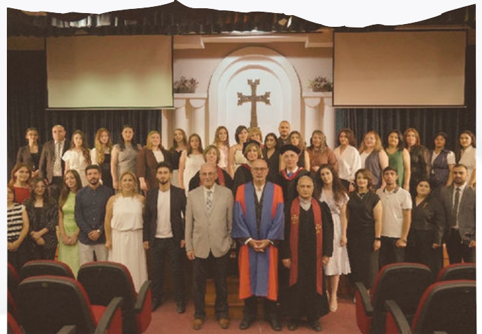
2025 Graduation in Armenia