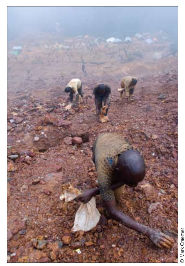
Miners scour for cassiterite with their bare hands, Bisie mine, North Kivu, April 2008.

In many parts of the provinces of North and South Kivu, armed groups and the Congolese national army control the trade in cassiterite (tin ore), gold, columbite-tantalite (coltan), wolframite (a source of tungsten) and other minerals. The unregulated nature of the mining sector in