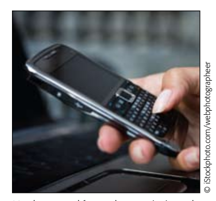
Metals extracted from coltan, cassiterite and wolframite are all used in the manufacture of electronic goods.

• The FARDC and the FDLR – supposedly battlefield enemies – often act in collaboration, carving up