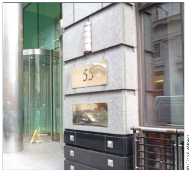
AMC's offices in central London. AMC's subsidiary, THAISARCO, is among the companies importing minerals from comptoirs whose suppliers have links with armed groups.

them, without verifying the exact origin of the minerals or the identity of intermediaries. In reality, some of these "legal" suppliers are among the main facilitators of the illicit trade with armed groups and army units.