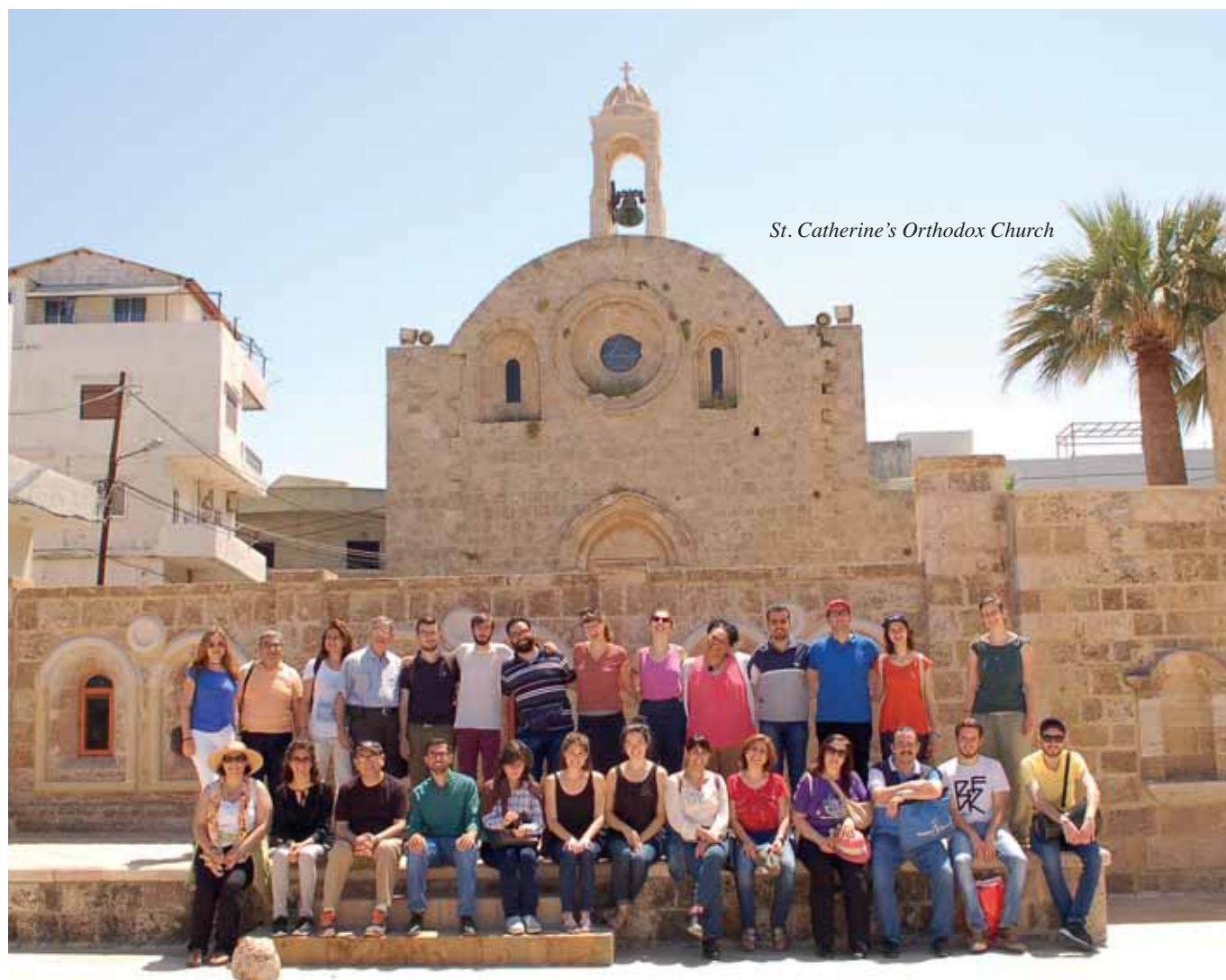
St. Catherine's Orthodox Church

The annual Spring Trip/Retreat took place on May 13, 2017. It consisted of a one-day trip to the northern coastal town of Anfeh. Twenty-nine students and faculty members took part. The purpose of the trip was to learn about the rich archaeological and Christian history of the town. Several ancient churches - Byzantine and Crusader - as well as two Orthodox monasteries were visited, and there was ample time for fellowship, prayer and singing.