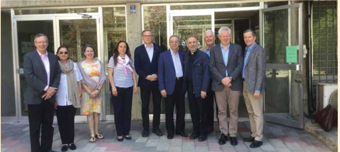
The Awareness Foundation