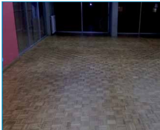
Before and after!