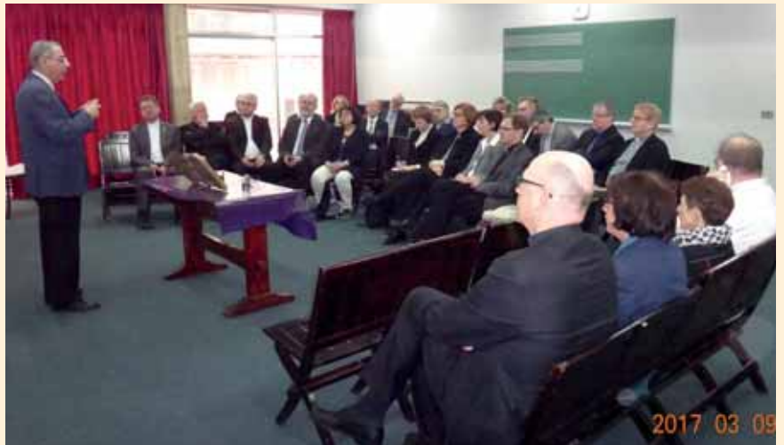
Addressing the German Delegation in the Bailey Chapel