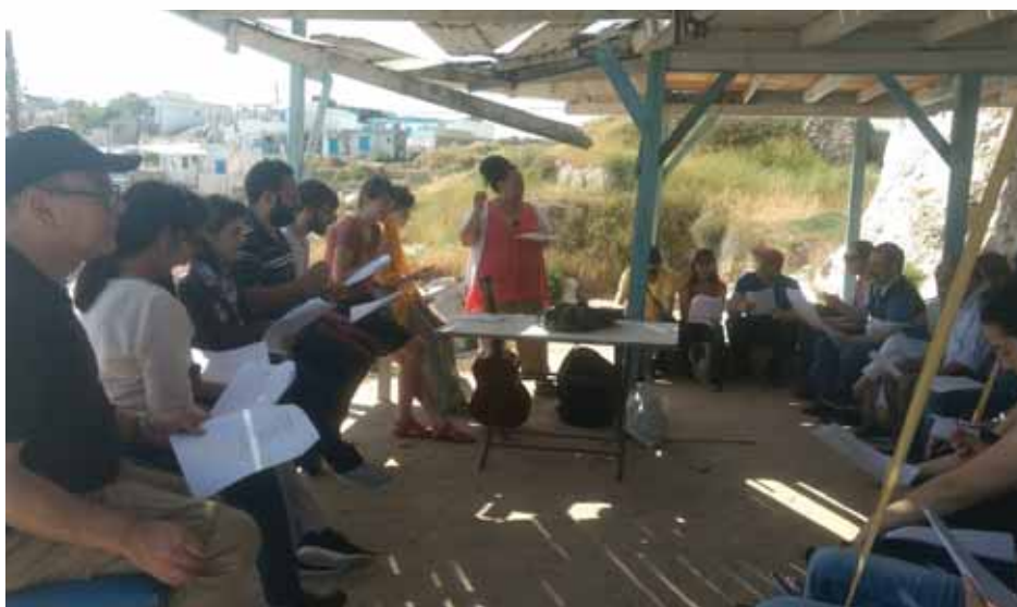
Singing and praying

The annual Spring Trip/Retreat took place on May 13, 2017. It consisted of a one-day trip to the northern coastal town of Anfeh. Twenty-nine students and faculty members took part. The purpose of the trip was to learn about the rich archaeological and Christian history of the town. Several ancient churches - Byzantine and Crusader - as well as two Orthodox monasteries were visited, and there was ample time for fellowship, prayer and singing.