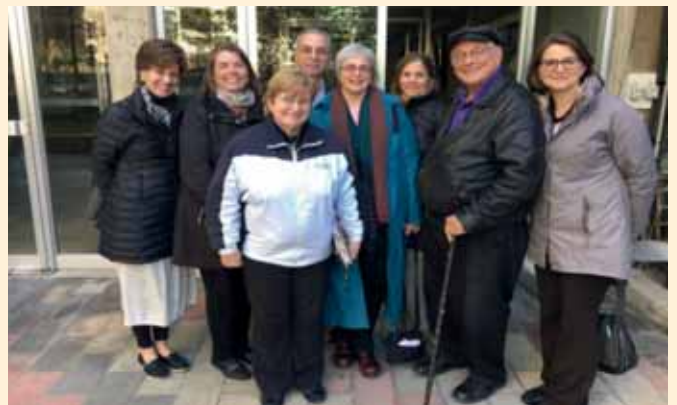
Bryn Mawr Church group