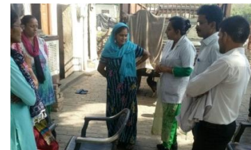
The RHOP team counselling a pregnant mother in the community

In the Out patients a total of Rupees 17,670/- (Seventeen Thousand six hundred and seventy) were spent on out-patient files charges and investigations while a total of Rs 1,84,000/- Rupees One hundred eighty four thousand were given as aid towards the hospitalization bill. The cost of transport is