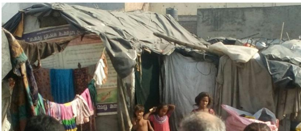
A picture of one of the poorest areas- a rag picker slum colony.

approximately one thousand rupees per month.