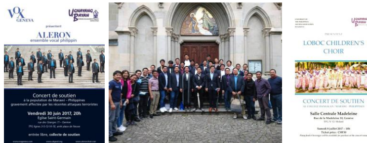
Center: the Aleron Choir with some members of the Filipino community