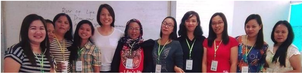
Participants from Dansalan College

A team from Silliman University, in coordination with the Northwest Mindanao Jurisdiction, conducted a Trainers Training on Trauma Awareness and Resiliency at MSU-IIT Iligan City. There were about 40 participants from Dansalan College and from the conferences.