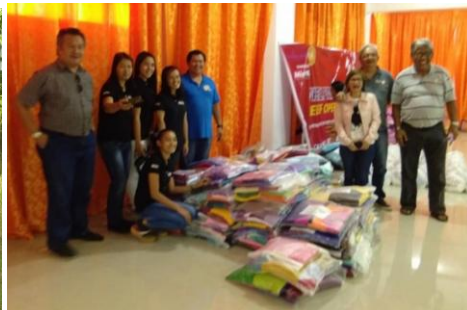
Gingoog Christian College