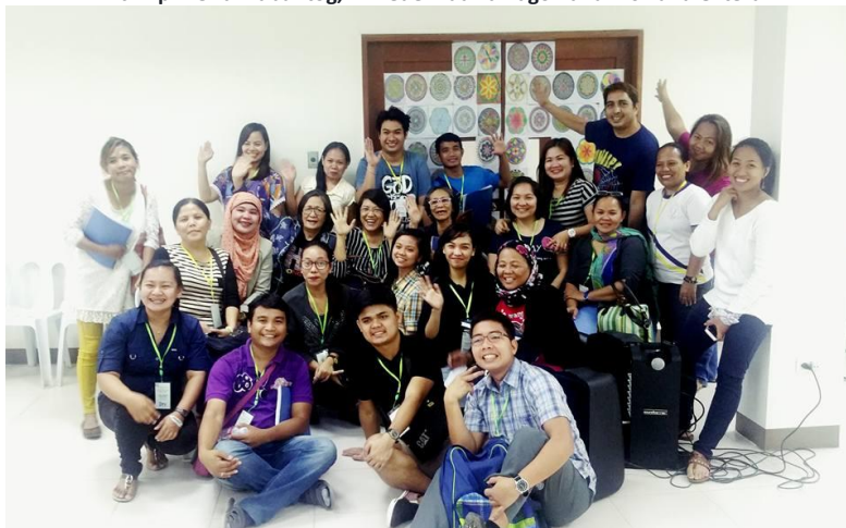
With the resource persons and other participants