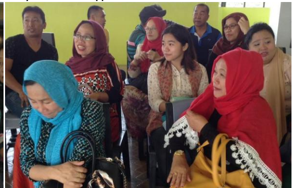
Orientation meeting with some of the parents