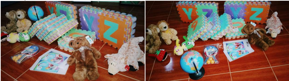
Some stuff for the Pre-School children