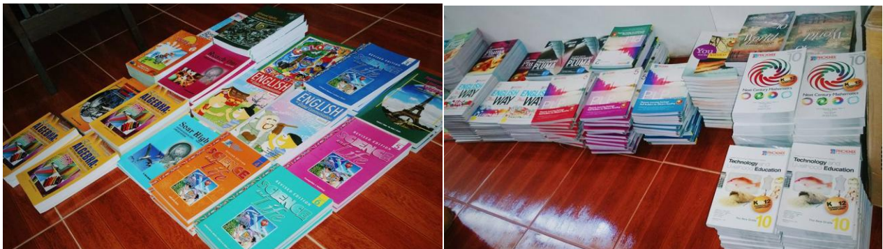
Textbooks for the different subject areas for all grade levels