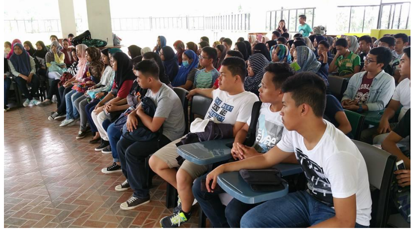
Chairs for the roof deck where meetings are held; Students in a convocation