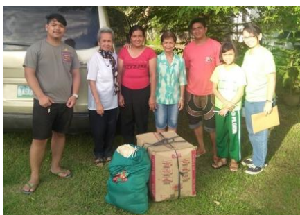
Pilgrim Christian College

Churches and institutions came to visit, among others