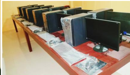
Computers for the IT laboratory