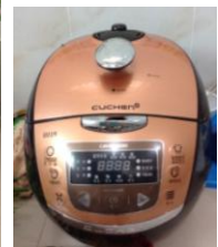
Equipment and appliances for vocational-technology subjects (also used in the cafeteria)