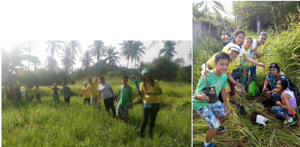
CYAF Iligan Tree Planting @ Dansalan College