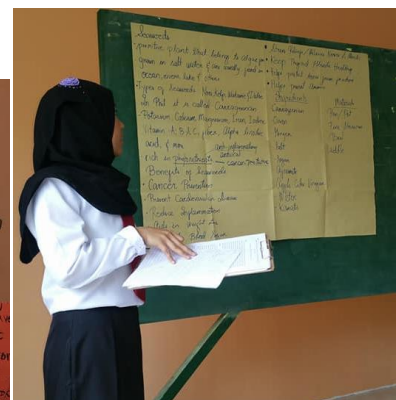
Students making project presentations in class