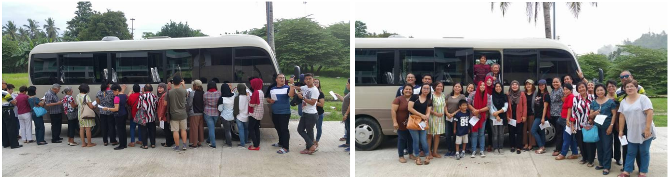
Blessing of the school bus