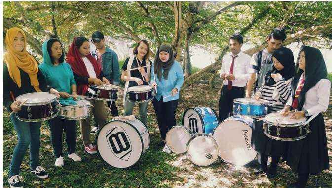
Musical instruments for the Drum and Bugle Corps