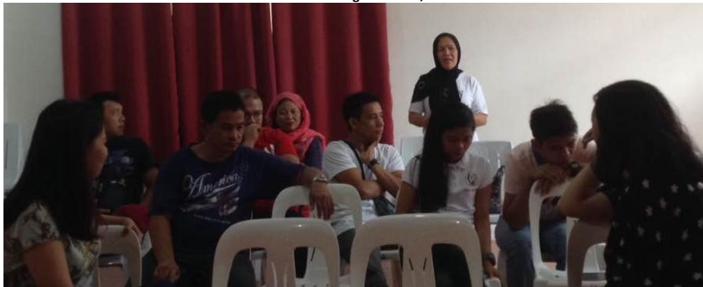
Meeting/Sharing with faculty and staff, mostly with those trapped