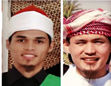
Abdullah and Omar Maute