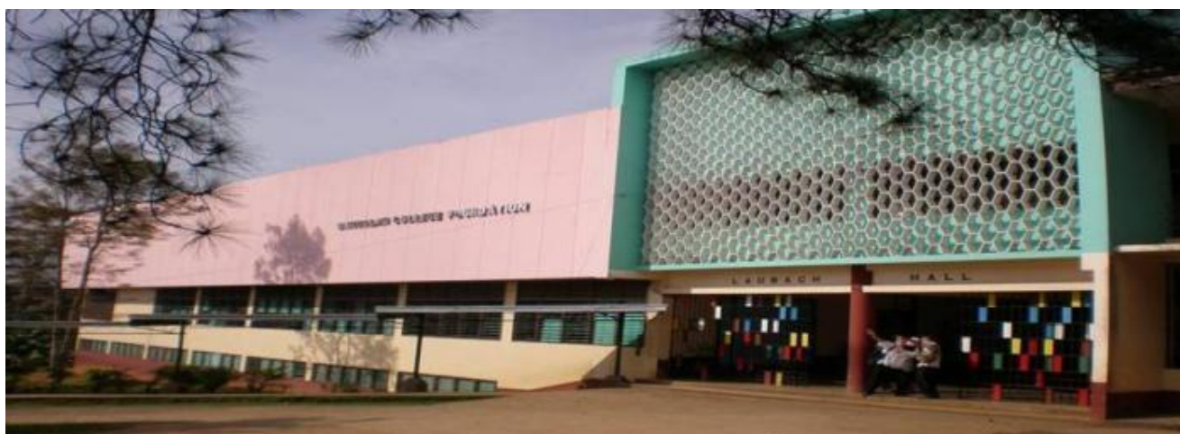
Laubach Hall and the lobby where the enrollment took place

It was the week of enrollment so the teachers were mostly on campus except for some who were attending seminars elsewhere. On that fateful day, teachers were attending to students at the lobby of Laubach Hall where tables were set for the enrollment process.