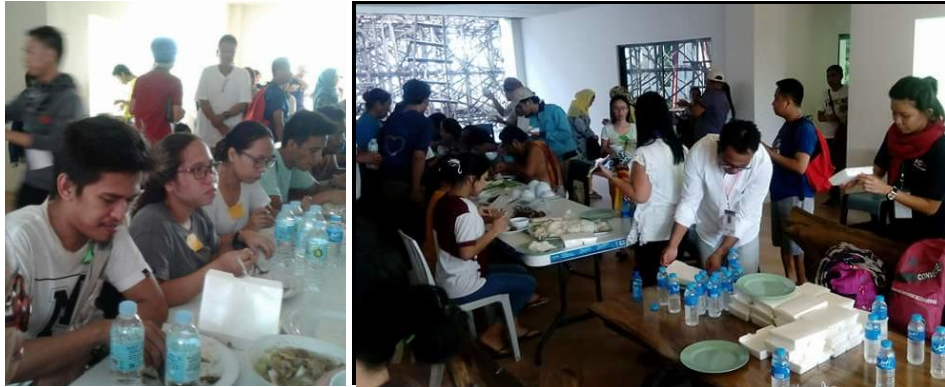
Finally, food and water, a good bath, and mattresses to sleep on