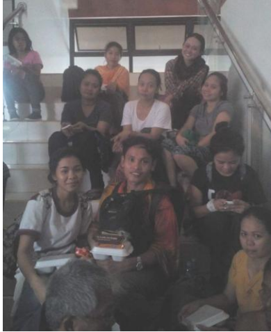
At the government shelter, feeling relieved and safe