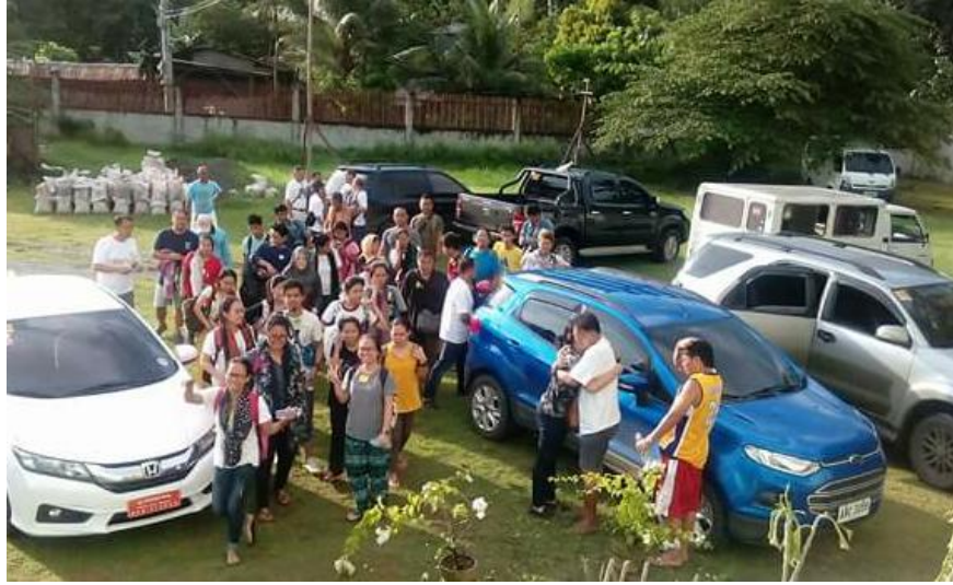
At the DC campus in Lambaguhon