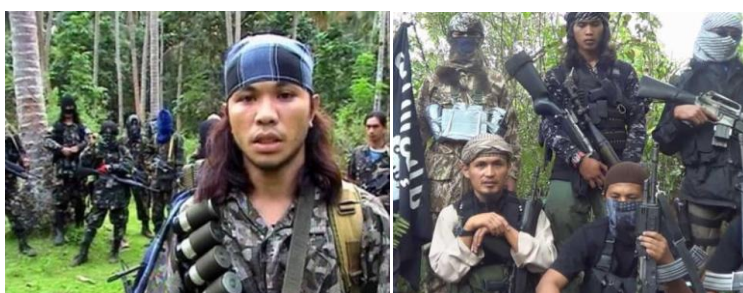
Abu Sayyaf

On May 23, 2017, government forces launched a military operation to arrest Isnilon Hapilon. The Abu Sayyaf opened fire and asked reinforcement from the Maute group, then deployed in various places in the city.