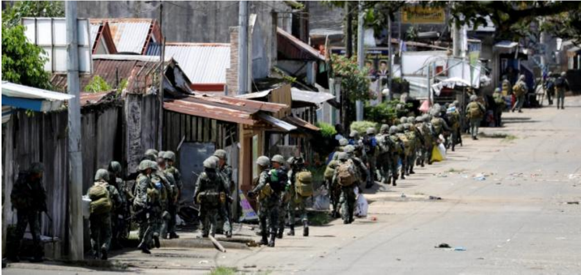
Philippine marines