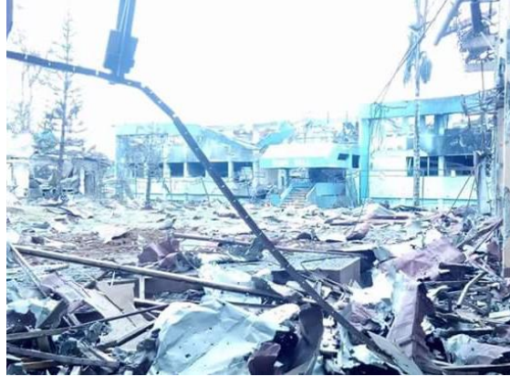
What used to be Hamm Hall