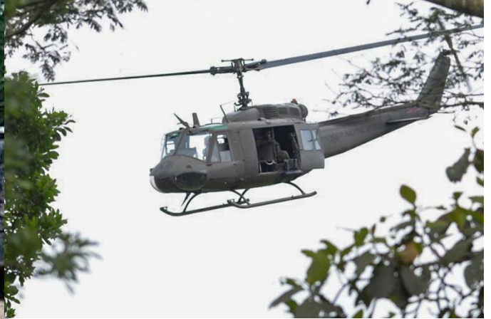
Military helicopter over the city