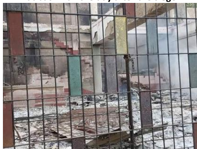
The lobby of Laubach Hall