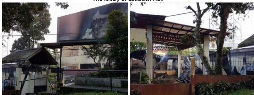
The science building