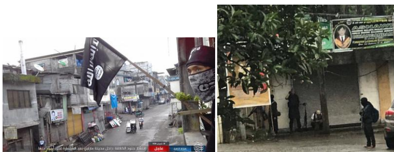
ISIS flag during the Marawi Siege

The Maute group attacked Camp Ranao, took over government buildings, burned the city jail, occupied the main street, set Saint Mary's Church on fire, killed the chief of police, took a priest and several churchgoers hostage... They roamed the streets of Marawi, dressed in black, waving the ISIS flag.