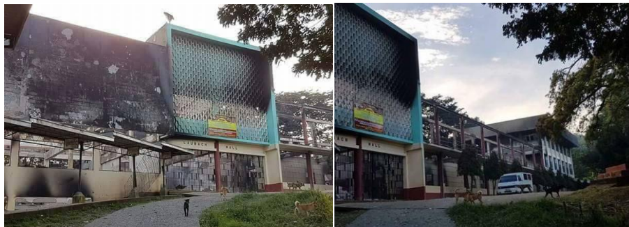
Laubach Hall the day after the siege

Dansalan College had housing facilities for personnel. The Green House, Yellow House, White House, Mission House, Guest House and parsonage inside the campus were for single faculty and staff. Outside the campus, Van Vactor Hall, Spencer Hall and Heffington Hall were for those with families. Everything inside these facilities were all turned to ashes. Most of the residents were left with nothing but the clothes they were wearing.