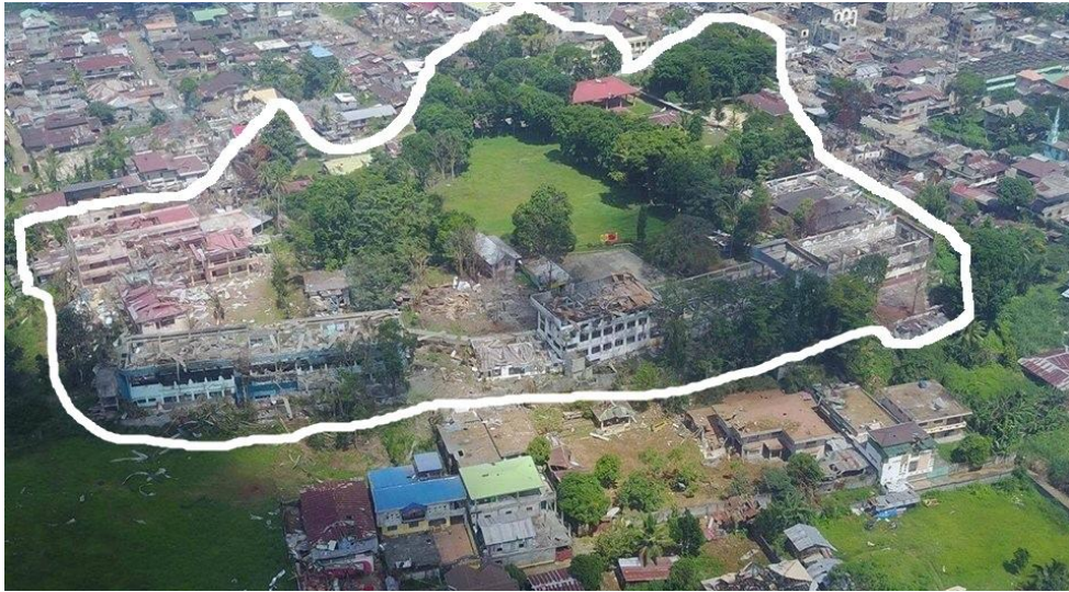
An earlier photo of the campus and the ravaged structures. The buildings were later transformed to empty shells.

All the buildings and structures in the campus -18 in all - were destroyed by fire and airstrikes.