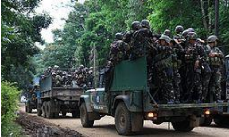
Phil military deployment to Marawi

On the same day, President Rodrigo Duterte declared martial law on the whole island of Mindanao.