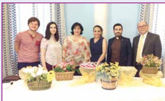
Armenian Evangelical Church in Anjar