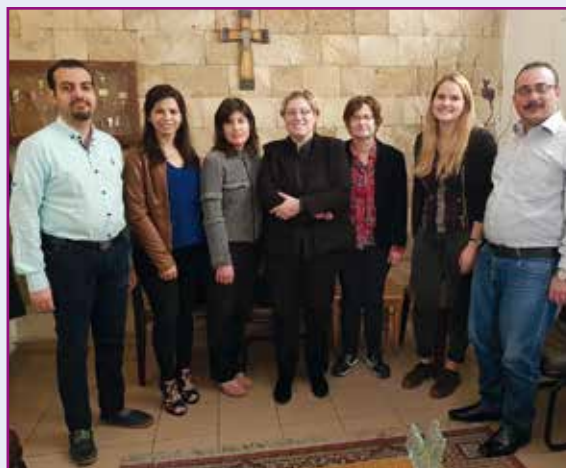
Evangelical Church in Tripoli