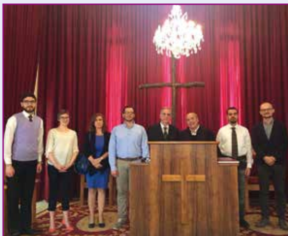
Majdalouna (and Jmayliyyeh) Presbyterian Church