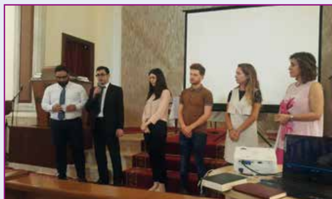
Evangelical Church in Minyara, Akkar region