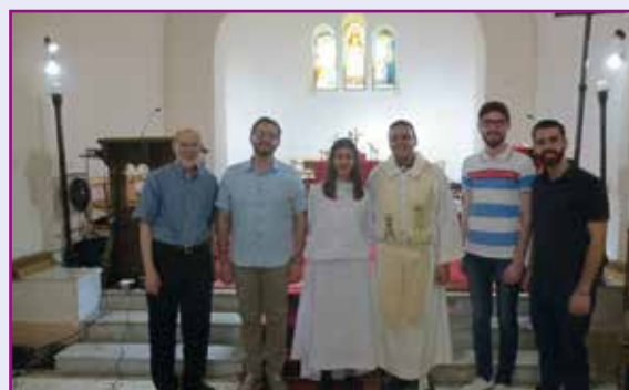
All Saints Episcopal Arabic Congregation, Beirut