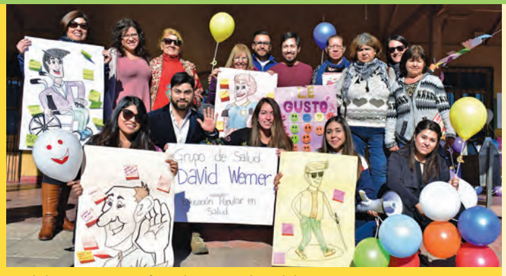
Workshop participants from the National Disability Service carry out community actions to create awareness about creating a more just and inclusive society.