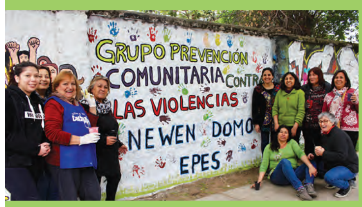
The group Newen Domo calls for the organization and mobilization of women as a central task to denaturalize gender violence. The mural was created on November 24, 2017 in front of the EPES office in Santiago, in the context of the International Day for the Elimination of Violence against Women, with the purpose of installing in public spaces the urgent need to eradicate machismo from our lives.