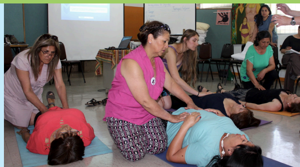
Health promoters putting into practice relaxation exercises learned during the Psychological First Aid workshop.

The 20-hour course, held in two full days, equipped participants with theoretical and practical tools that draw from popular education methods and principles. The focus on rights and social determinants of health will foster their work with the local community and with other sectors of society.