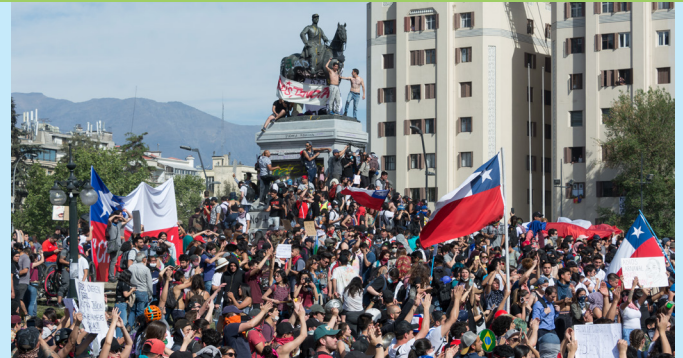
Protesters in Plaza Baquedano, downtown Santiago, Chile, October 22, 2019

What does this mean for EPES? Although many aspects of "normal" life have been altered, our work continues with community health teams, immigrant communities, as well as national networks working for Health for All and to end violence against women. We have helped organize local assemblies, our centers provide a meeting space for many organizations, and we have hosted seminars with experts to understand what is happening. We have also organized stress management sessions for the health teams and staff, many of whom are feeling retraumatized by the militarized atmosphere and systematic violation of human rights.