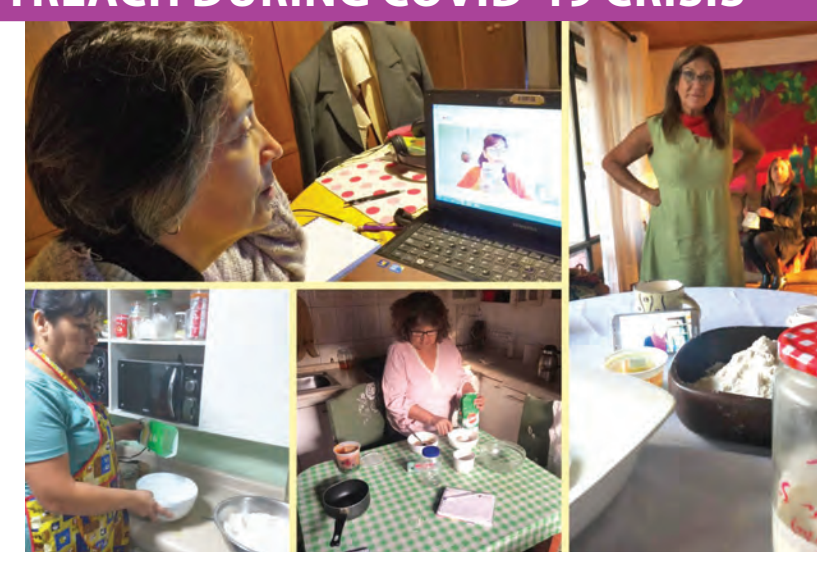
Health promoters quarantined at home participate in EPES' sourdough workshop.