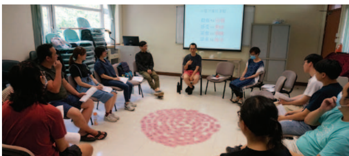
Nonviolent Communication Workshop on 18 June

harassment issues in the church. She has always wanted to be a pastor in the future after she completes her theological education. However, the program confronted her with the difficult fact that there are so many sexual harassment cases happening in churches, many of which are handled by denying the problem exists, which hurts both the victims of sexual harassment and the church community overall. She learned that the challenge ahead is how to build a church with mutual trust and a safe church. This is not her own personal challenge – it's a challenge for everyone in the church, including you and me.