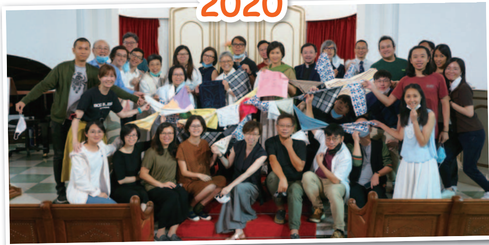
Opening ceremony in Kowloon Union Church on 9 June

Since 2007, the Ecumenical Summer Internship Program have been serving as a platform to gather youths and theological students in Hong Kong. Every year, around 10 students are enrolled in a summer internship program, in which they are given the chance to experience their own ecumenical journey by taking on community pastoral roles with help from local churches and NGOs.