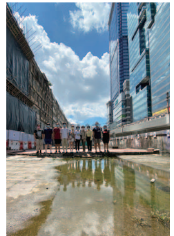
Kwun Tong Community walk between the old and the new on 11 June

Policy Advocacy: Hong Kong Christian Institute, Kwun Tong Methodist Social Service