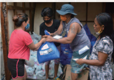
National Council of Churches in the Philippines (NCCP) delivers relief packs to local communities